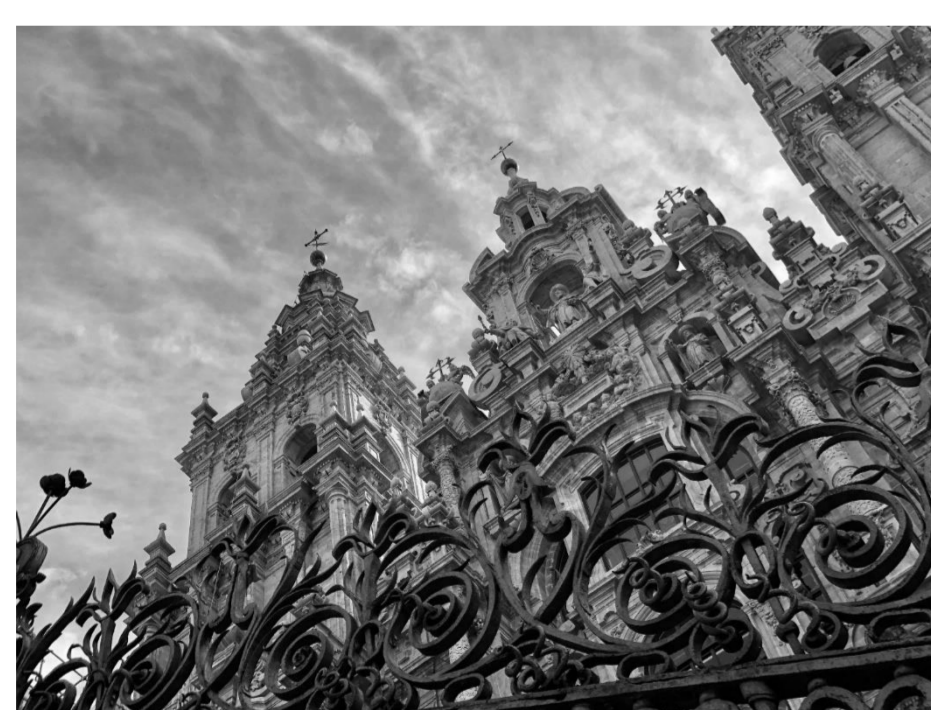
Figure 1 – How to insert a figure

Fill with text. Fill with text. Fill with text. Fill with text. Fill with text. Fill with text. Fill with text. text. Fill with text. Fill with text. Fill with text. Fill with text. Fill with text. Fill with text. Fill with text. Fill with text. Fill with text.